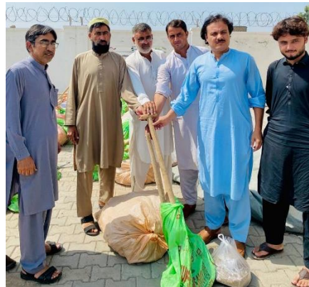
Figure 2. Distribution of Mott grass cuttings, DAP fertilizer and basic agricultural tools with 50 farmers in Bara Tehsil.

Each beneficiary received certified Mott grass cuttings, DAP fertilizer and basic agricultural tools including spades, sickles, hand hoes and diggers to support fodder establishment and management as shown in Figure 2.