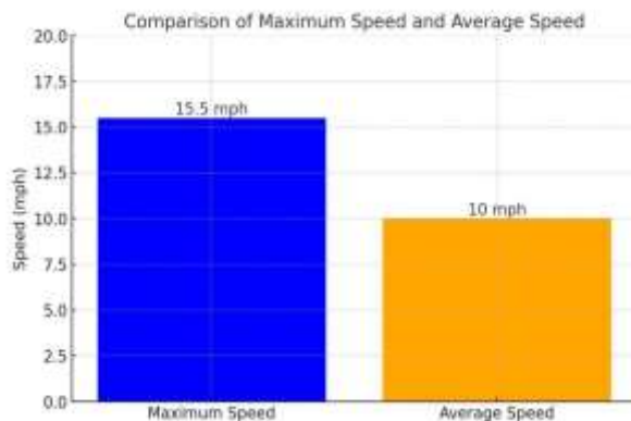
Figure 3 Comparisons of Maximum Speed and Average Speed