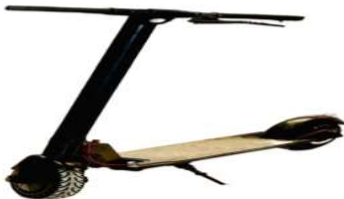
Figure 2 Fabricated Electric Scoote